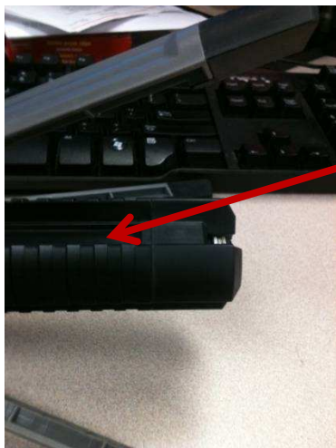
Center battery chamber