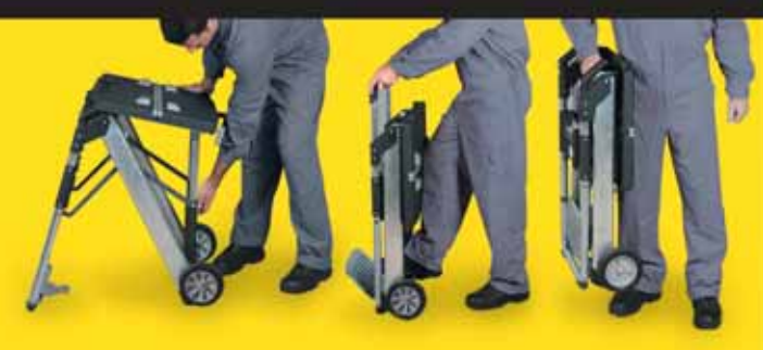
FROM WORK SURFACE TO HAND CART AND BACK