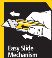
Easy Slide Mechanism

UTILITY KNIFE CUCHILLO DE USO GENERAL COUTEAU UTILITAIRE